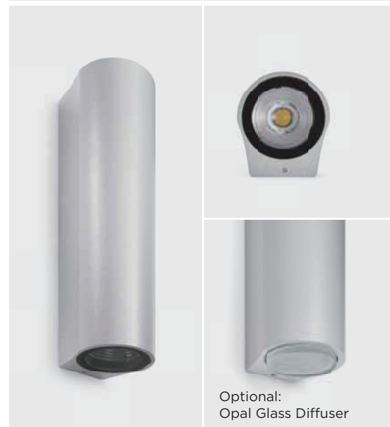
Optional: Opal Glass Diffuser